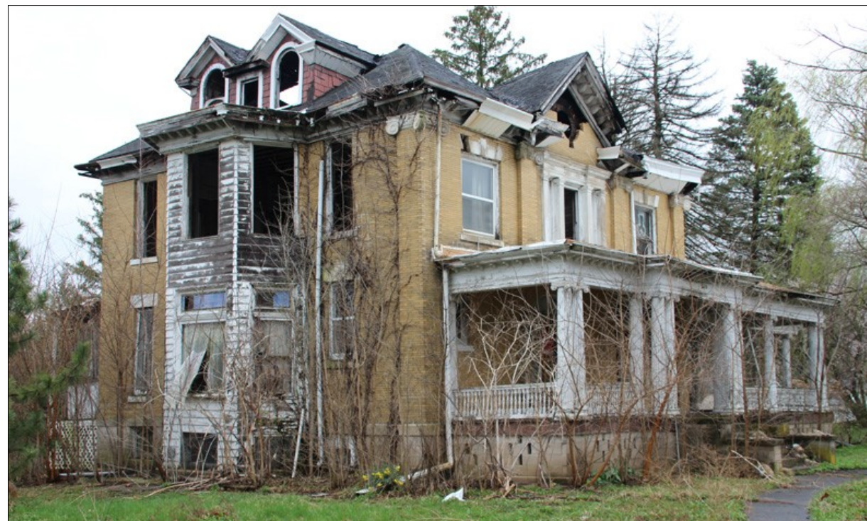
Once one of Hoopeston's most stately home, the former Dyer mansion, at 520 E. Honeywell, is set to be demolished next week.